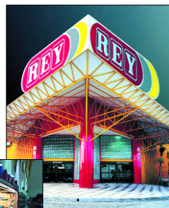
Panama-based Supermercados Rey's category management strategy allows the grocer to be more responsive to its customers, ensuring that it sells the right products in the right places at the right prices—using the right promotions.